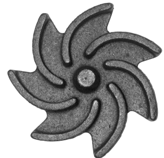
Vortex Type Impeller